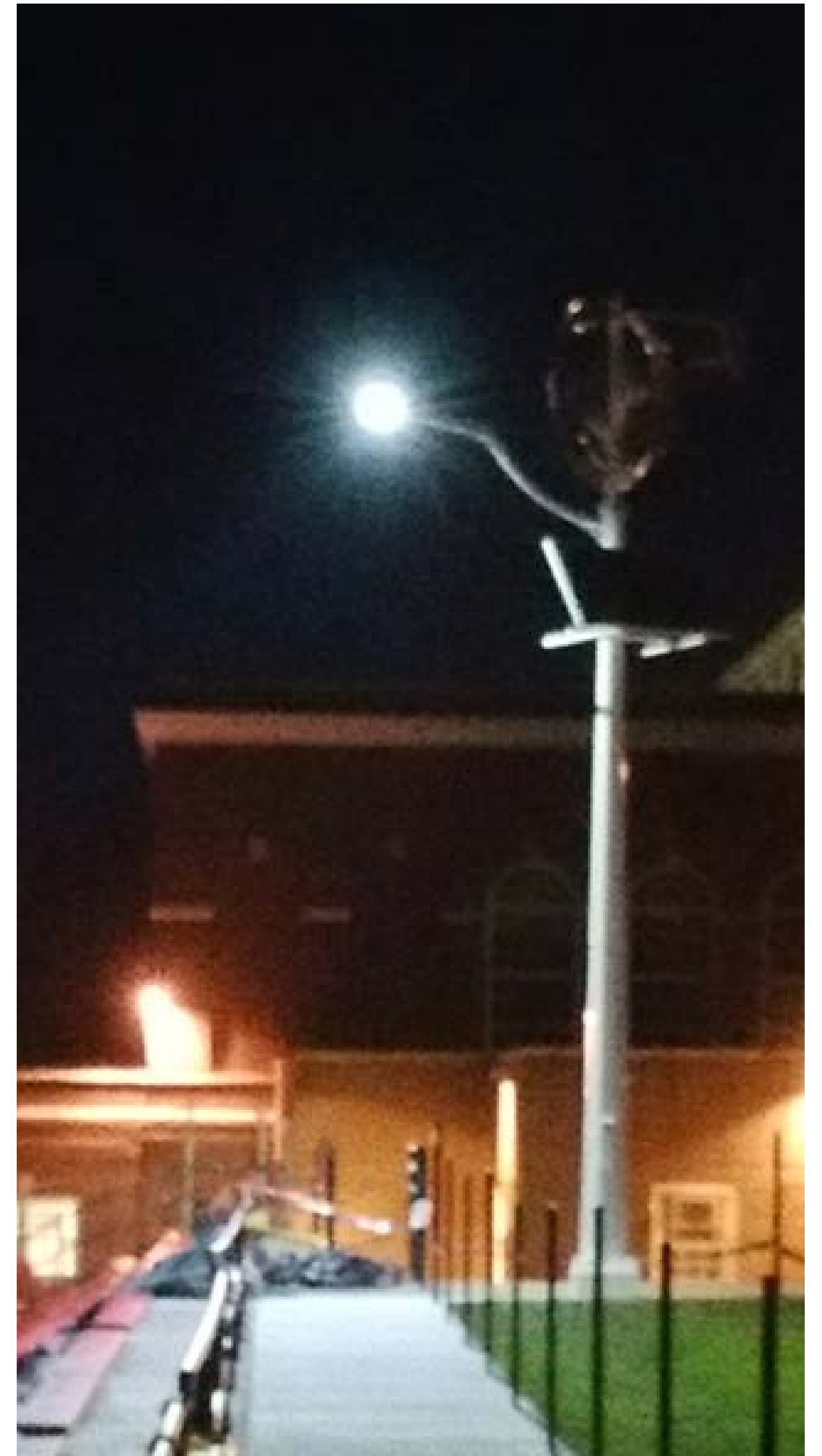
Light throw of dimmable 80w LED